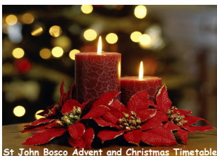
St John Bosco Advent and Christmas Timetable

St John Bosco Advent & Christmas timetable is available now from the porch.