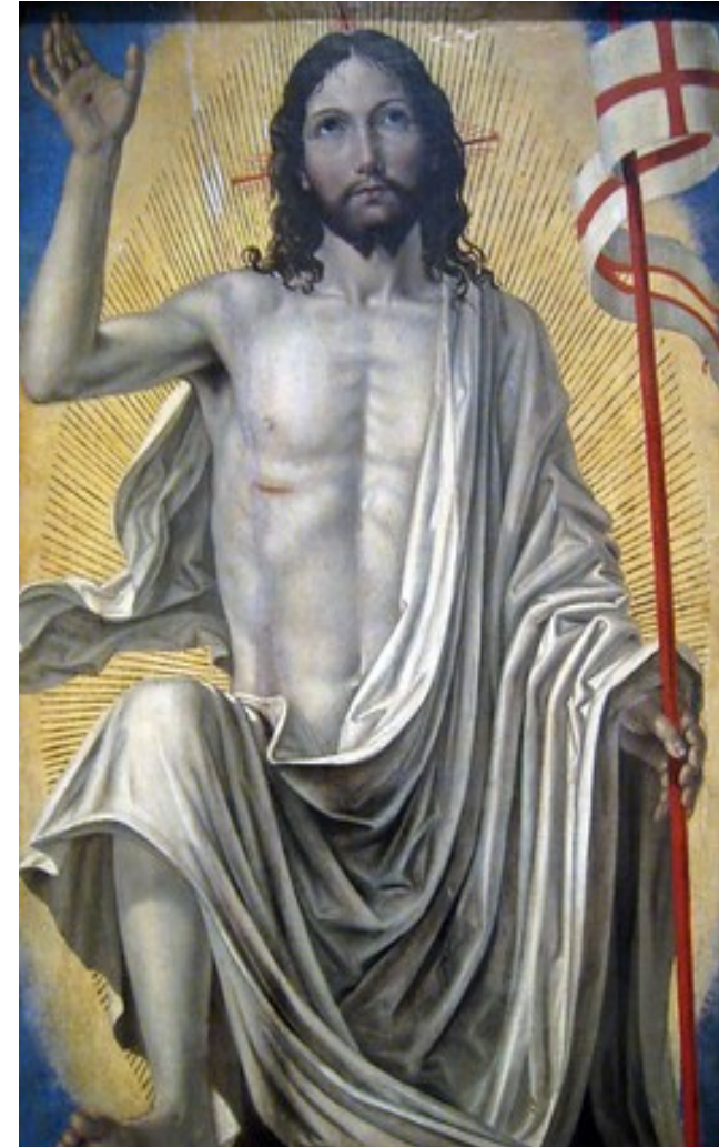
Ambrogio Bergognone, Christ Risen from the Tomb, c.1490, National Gallery Art

EASTER SUNDAY of the Resurrection of the Lord Yr A - April 5th 2026