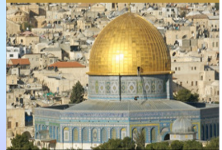
PILGRIMAGE TO THE HOLY LAND 2012